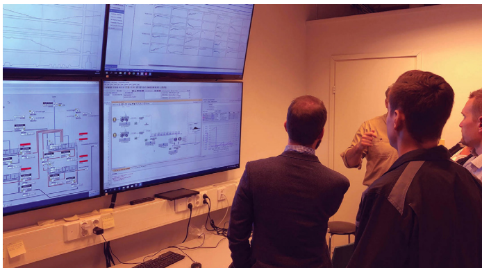
Oulu students see textbook theories applied in the pilot plant